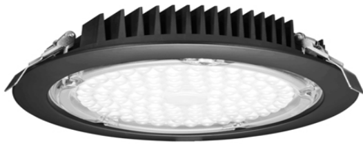
Type IC, Air-Tight & Wet